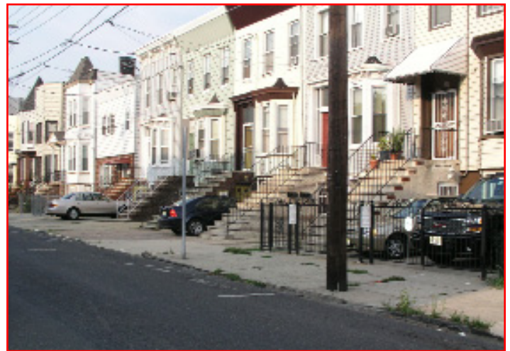
FUTURE WITH R1 ZONING AMENDMENTS

Proposed changes to Jersey City zoning will create a sea of concrete in our neighborhood, make parked cars the dominant visual element in our front yards, and reduce our cherished privacy. We need your help to preserve our neighborhood.