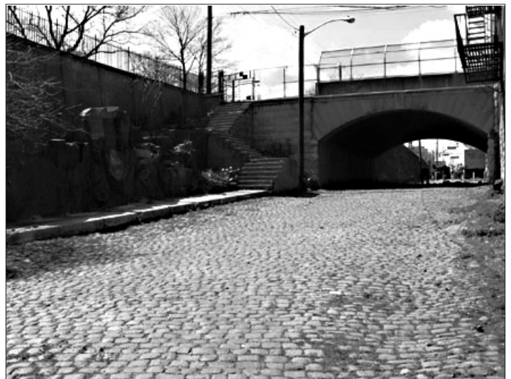
Holland Street and Ogden Avenue Bridge

Membership dues and donations help sustain the RNA. Annual dues are $10 for residents and $15 for those outside RNA boundaries. Please contribute at an RNA meeting or make checks payable to Riverview Neighborhood Association and mail c/o RNA, 154 Ogden Ave., 3E, Jersey City, NJ 07307.