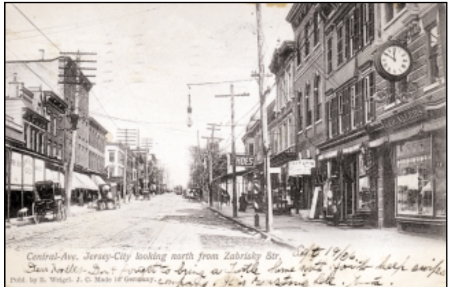
Central Avenue looking north from Zabriskey Street 1906 postcard