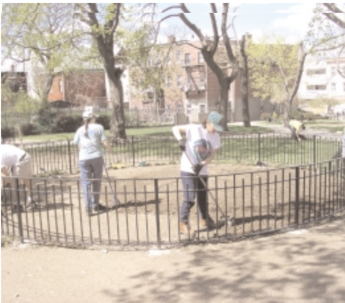
Tilling for the sunflower seed planting