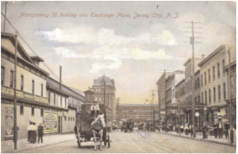
Montgomery St. looking into Exchange Place, Jersey City, NJ, 1908 postcard