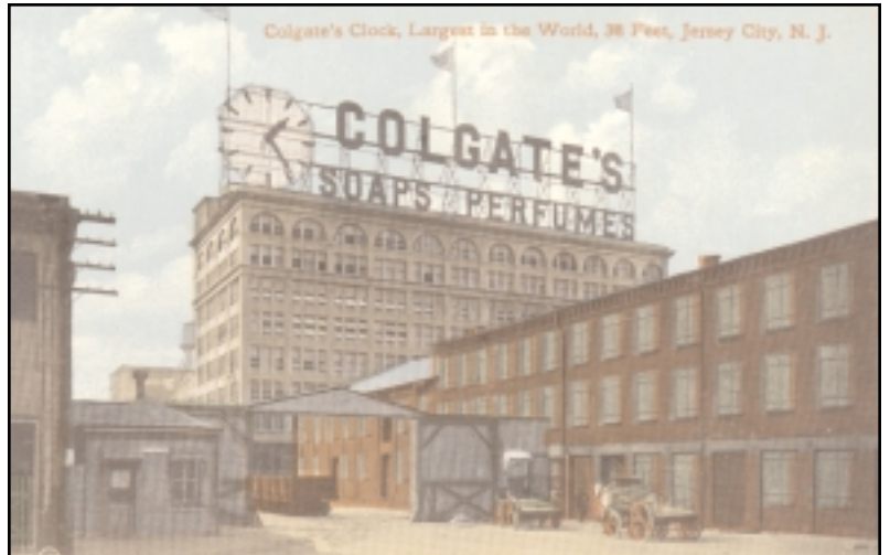
Colgate Clock, Largest in the World, 38 feet, Jersey City, NJ, 1911 postcard

There will be no official business conducted.