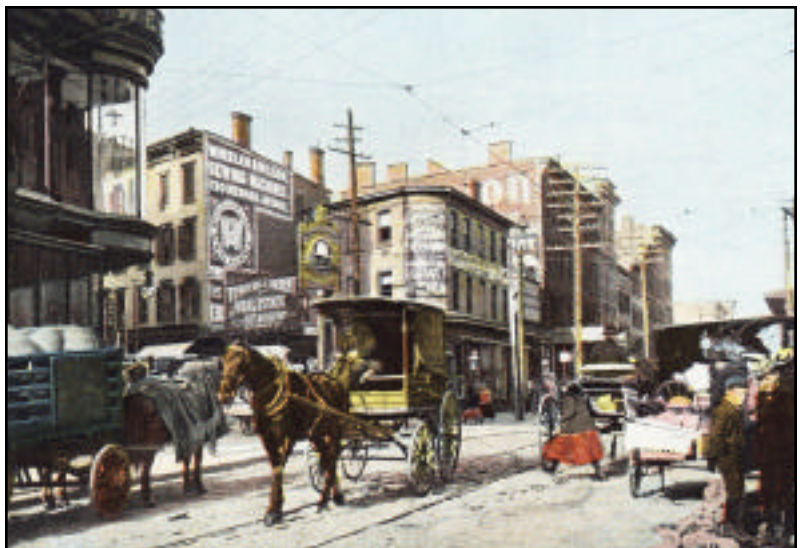
Corner of Newark Avenue and Grove Street, Jersey City, NJ, 1909 postcard