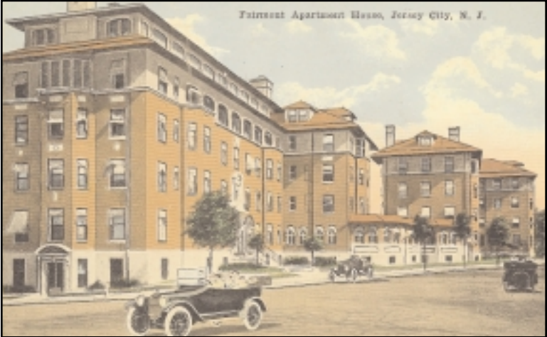
"Fairmont Apartment House" Jersey City, N. J., 1920 postcard (Located at 2595 Kennedy Boulevard, between Duncan and Fairmont Avenues.)