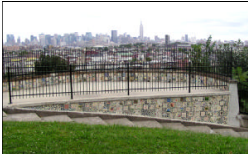
“North Lookout/Observation Deck in Riverview-Fisk Park” The sweeping vista of the Manhattan skyline has always been an attraction to Riverview-Fisk Park. Now with the completion of the “Tile Project” the refurbished vantage point is a reason in itself to come back for another look.